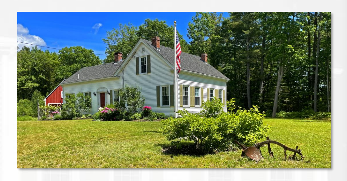
Falmouth Heritage Museum 60 Woods Road (next to Transfer Station)