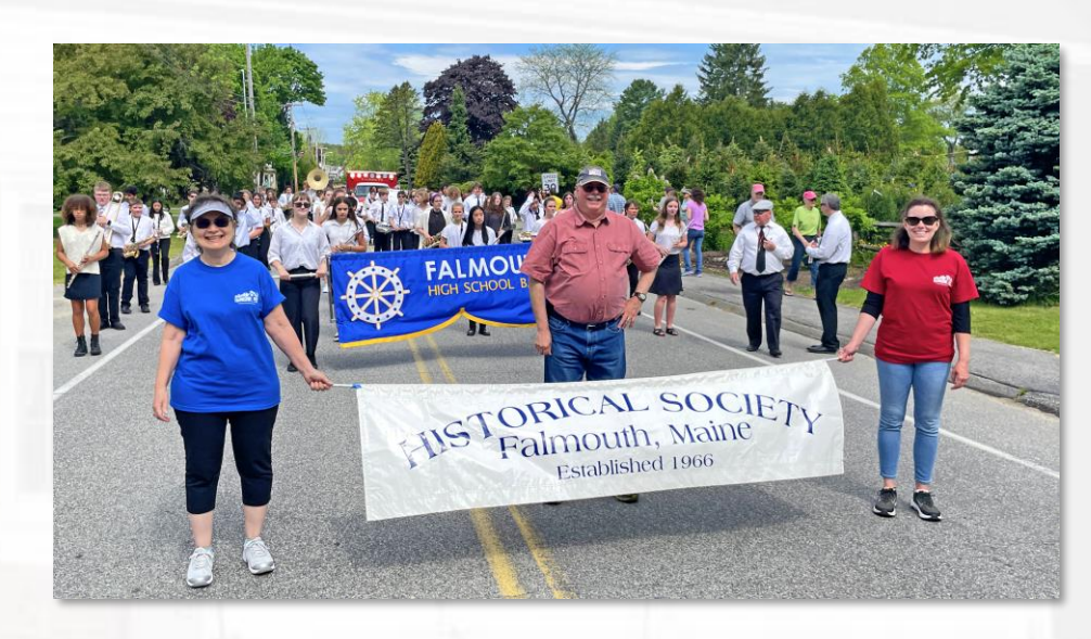
FHS in Memorial Day Parade